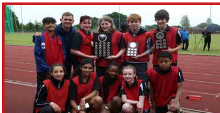
Sports Day Champions 2019 Catherine House