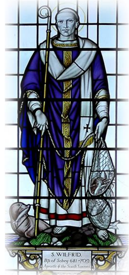
S. WILFRID. Bp of Selby 681-709 Apostle of the South Saxons

Reflection: The 12 th October was the Feast of Saint Wilfrid, the patron of our community.