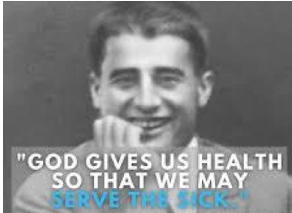
St Pier Giorgio Frassati