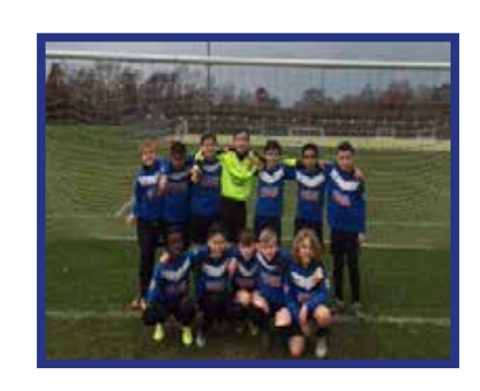
Year 7 Football Squad

It has been a challenging term for our football team. Our Year 7 league winners from last season have been challenged by stepping up a year representing our Year 8/9 team. The team have faced physically stronger opposition, which will only benefit the team when competing at their own age group next year. Performances have improved considerably throughout the season with the team narrowly being defeated in the Sussex County Cup after a spirited display. Three of our football teams have Sussex County Shield games to look forward to in the coming weeks. In addition to this a number of students will continue to represent the County and North Sussex District teams.